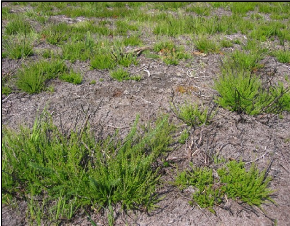
Heather regeneration 4 months after burning