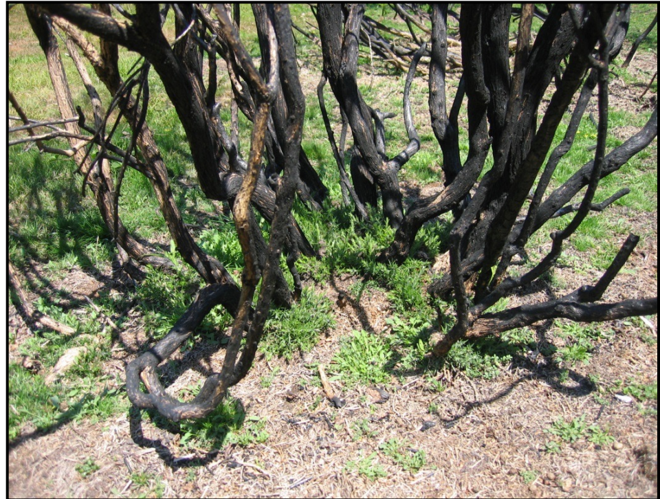
Gorse regeneration 4 months after burning